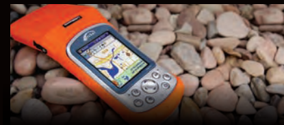
Archer plus Hemisphere GPS XF101 Receiver

Copyright 09/09 Juniper Systems, Inc. Specifications are subject to change without notice. Juniper Systems, the Juniper Systems logo, and Archer Field PC are registered trademarks of Juniper Systems, Inc. Bluetooth is a registered trademark of the Bluetooth SIG, Inc. All other trademarks are registered or recognized by their respective owners.