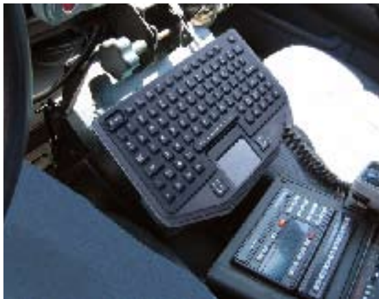
Photo of typical M779 installation in a police cruiser.

Email: sales@DuraTechUSA.com www.DuraTechUSA.com