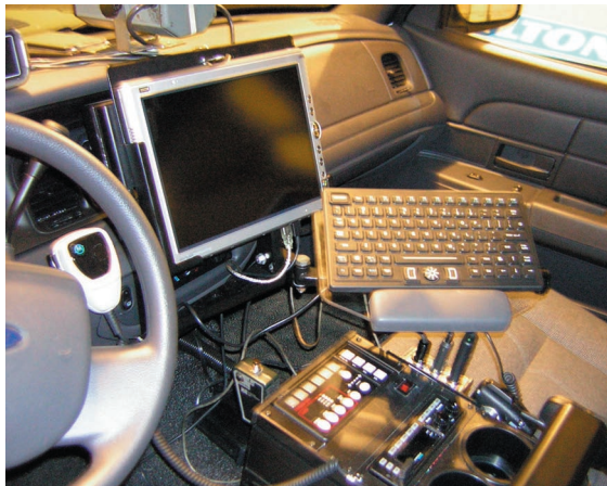
Photo of typical M777 installation in a police cruiser.

The design minimizes grooves where dust or other elements may accumulate, making it simple to wipe down for cleaning. This new design helps preserve a "clean room" environment.