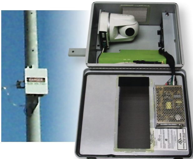
PTZ covert camera ▶

The units utilizes a non ground plane antenna, power supply, and cooling fans that have been in use in Arizona for over 3 years.