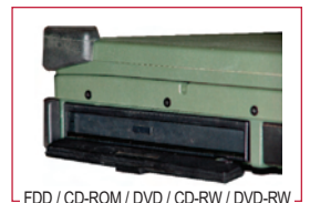
FDD / CD-ROM / DVD / CD-RW / DVD-RW