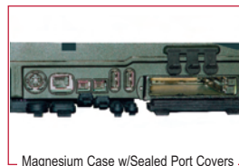
Magnesium Case w/Sealed Port Covers