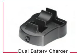
Dual Battery Charger