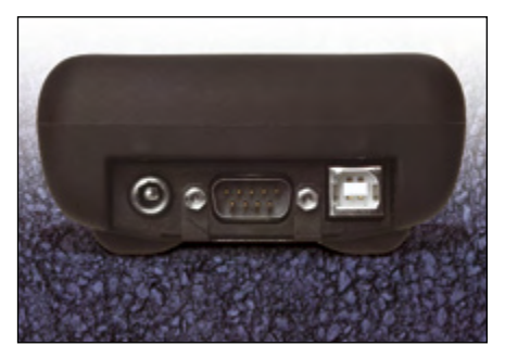
The 9-pin RS-232 serial and USB ports accept standard computer cables for maximum compatibility. And the Recon's internal components are fully sealed and protected in case of accidental immersion in water.

©2006 Tripod Data Systems, Inc. All rights reserved. Recon is a registered trademark of Tripod Data Systems. Tripod Data Systems, the TDS triangles logo, PowerBoot Module, AA PowerBoot Module, CF-Cap, Extended CF-Cap, and Optical CF-Cap re trademarks of Tripod Data Systems. Microsoft, Windows, and the Windows logo are trademarks or registered trademarks of Microsoft Corporation in the United States and/or other countries. Other brand names and trademarks are property of their respective owners. Color display images shown may vary slightly from actual display. Specifications subject to change