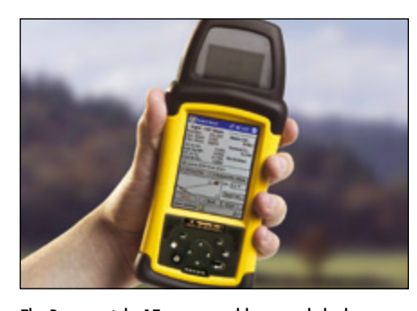
The Recon weighs 17 ounces and has rounded edges that fit comfortably in your hand. Optional modules include a AA PowerBoot Module and various CF-caps that support larger accessories such as GPS receivers or bar code scanners.