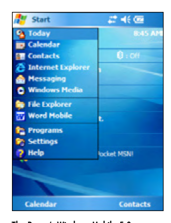
The Recon's Windows Mobile 5.0 software runs all the applications you use most.

The compact Recon weighs just 17 ounces, yet its rugged design delivers reliable performance in the field. The Recon meets rigorous MIL-STD-810F military standard for drops, vibration, humidity, altitude and extreme temperatures. And with an IP67 rating, it's impervious to water and dust.