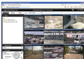
Secure Browser Access