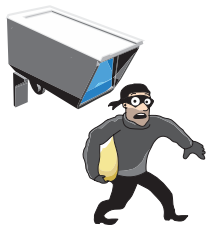
Camera in Action