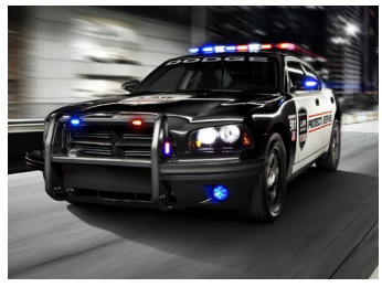
EMS / First Responders / Fleets

Mission-Critical Networking for the Most Challenging Environments