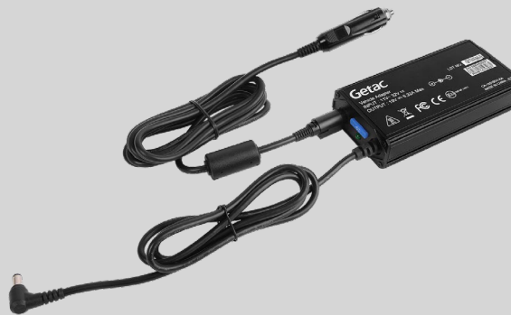
Cigarette Lighter Plug Version