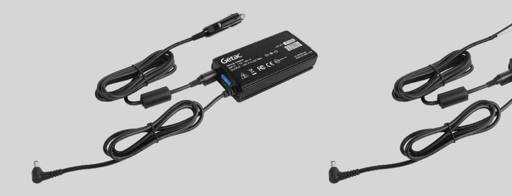
Cigarette Lighter Plug Version

(Cigarette Lighter Plug Version) GAD2X8 (Bare Wire Version)