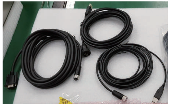
VGA cable/ HDMI cable/ USB cable