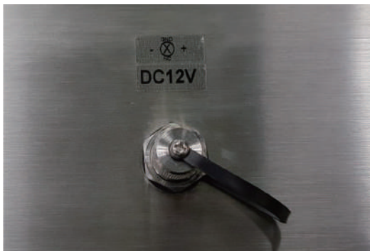
Waterproof Power Connector