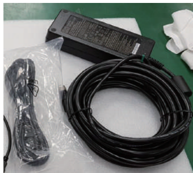
Power cord/ Power adapter with waterproof caconnector